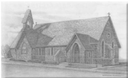
Established in 1832